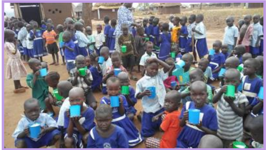
Photo 10. Children in Dzaipi Parish

It is an investment with a long-term view as these little ones will grow, developing in themselves the sense of the other, sharing, respect and mutual help, in small gestures in the classroom, and in a very playful way. A cultivated faith in the children's families provides us with Christian values from which to build on.