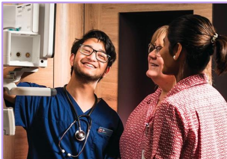
Photo 5. Healthcare workers in our Cabrini family at Cabrini Health in Malvern, Australia

The Missionary Sisters of the Sacred Heart of Jesus arrived in Melbourne in 1948. Inspired by the healing ministry of Jesus, they expressed their mission in seeking out and serving the needy and making known the Good News through their actions.