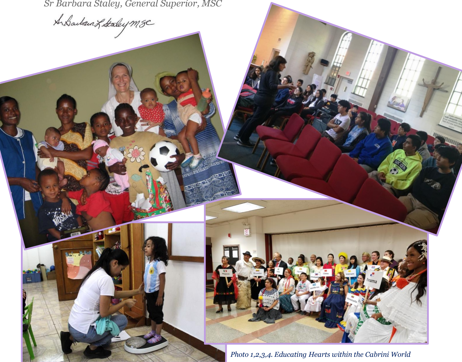
Photo 1,2,3,4. Educating Hearts within the Cabrini World