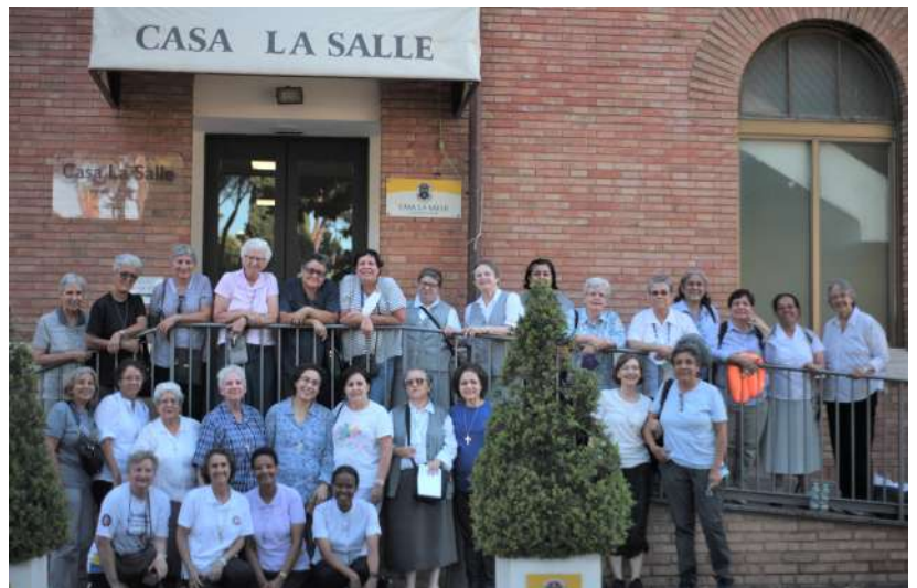
The MSCs at Casa La Salle during one of the weekends of the General Chapter.

This time gave us the opportunity to see even more the witness of the laity in sharing the experience of our Charism, expressed in the various missions: with the homeless, with migrants at the border between Mexico and Texas, in educational pastoral care, in the time of Covid-19, in promoting human dignity. In all this, we perceive the merciful love and compassion of the Cabrinian charism.