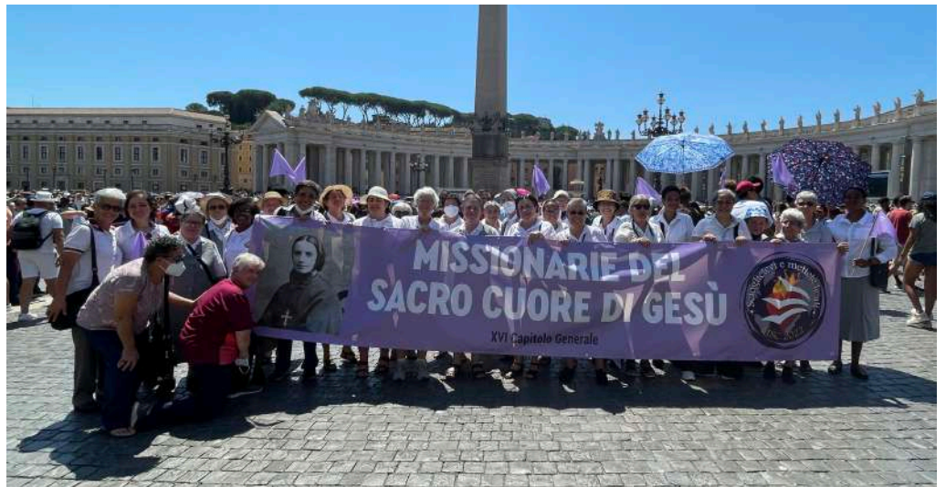
MSCs at Pope Francis' Angelus in St. Peter's Square.

Every Wednesday and Sunday evening, throughout the month, we gathered for the Movie Nights , which are some first results of the Oral History project. Every evening, we were able to watch and hear the stories of one or two elderly Sisters of the Institute, already interviewed over the past months in different parts of the world. We continued to enrich ourselves with their life stories and the testimony of their religious life at the service of the Institute.