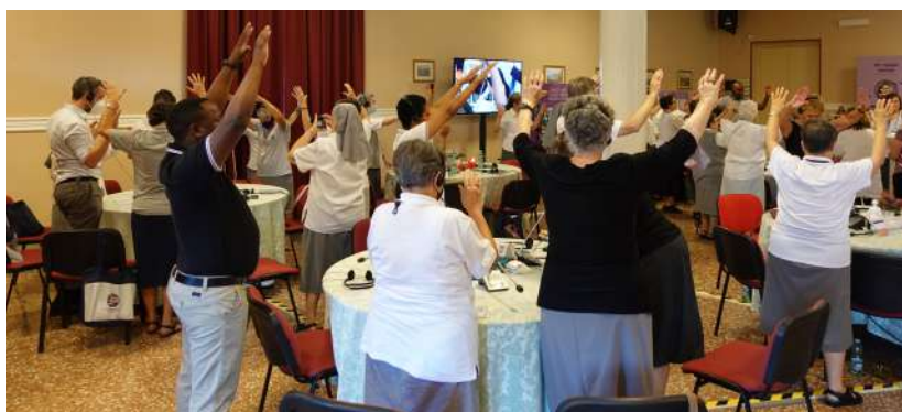
Sisters and Laity during a moment of prayer.

On July 7 and 8, the Chapter participants, sisters and laity, shared the question: What have we