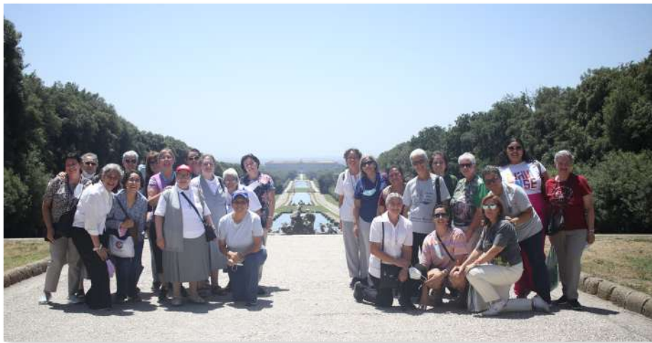
Sisters and lay people on trip to the Royal Palace of Caserta, Campania.

“In this XVI General Chapter, we experienced God’s call to be instruments of peace and love. We walk together and commit ourselves to show the world that we form a global, inclusive, ecclesial, synodal community. We believe that one of the pillars of this journey is listening and welcoming, and the co-responsibility among Sisters, between Sisters and Lay People, among Lay People. A new journey of the Holy Spirit began with Mother Cabrini. A new beginning for us today, in search of a unity that requires an inner and outer transformation. A fresh start to embrace our vulnerabilities and lovingly serve the most vulnerable ones by responding to the emerging challenges of today’s world.”