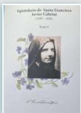
Cover V tome.

On this day we celebrated one of the most important ministries of our Institute. Thanks to those in the Cabrinian world who dedicate their lives to it! We are still continuing Mother Cabrini's apostolate of the "Education of the Heart"!