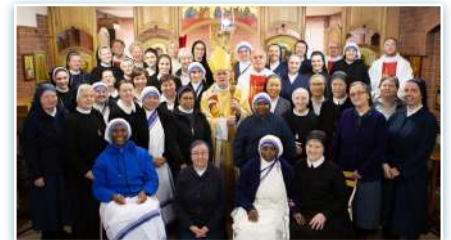
Intercongregational meeting of women religious from the Diocese of Novosibirsk.