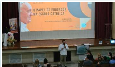
Training on the theme of the "Fraternity Campaign 2024" in Brazil.