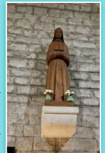
Wooden statue of Mother Cabrini in the basilica Church of St. Mary of the Sea.