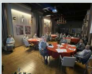
Photo from the Mater Gratiae Assembly.

From January 12 to 16, the Mater Gratiae Provincial Assembly was held. During the meetings, the Sisters and laity drew up guidelines for the next triennium. The various missions were then able to present their own works and activities. In a fraternal climate of sharing, the Cabrinian spirit was greatly appreciated, and the group of lay missionaries, which continues to increase in the Province, was welcomed with great faith.