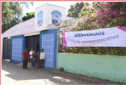
La Inmaculada Technical Institute.

presence of the MSCs, under the banner of the charism of St. Frances Cabrini. The MSCs began to weave this history in a rural neighborhood of the capital, Pochocuape and Loma Linda in 1974 with the dream of helping adolescents and young people with their educational and technical preparation. This work began after the Managua earthquake of December 1972, and today extends from kindergarten to high school, thanks to the Missionaries of the Sacred Heart who have given all their love, dedication and enthusiasm over the years.