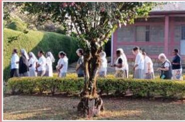
Recitation of the Holy Rosary at the mission in Dubbo.