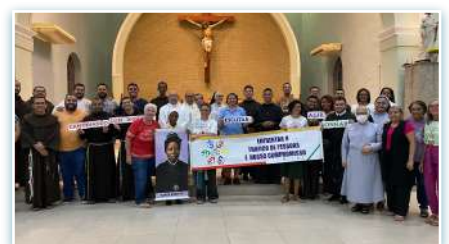
Celebration of World Anti-Trafficking Day at the Centro da Juventude in Brazil.

Pact with the team of social educators, family representatives and technicians from CRAS Sul II (Social Assistance Center). The Youth Center is busy with these concrete activities that will continue in 2024. Also at the same center, on February 16, they joined the "Um Grito pela Vida" Network on the feast of St. Josephine Bakhita and