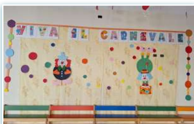
Carnival in the school of Sant'Angelo Lodigiano.