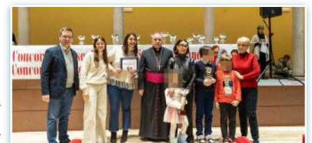
Award ceremony for the first prize of the crib competition in Milan.