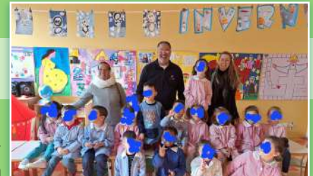
Visit to the school in Sant'Angelo Lodigiano.