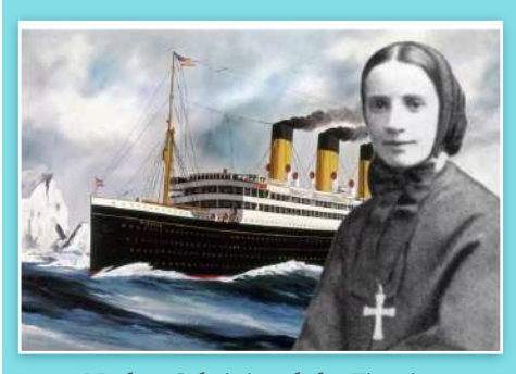
Mother Cabrini and the Titanic.