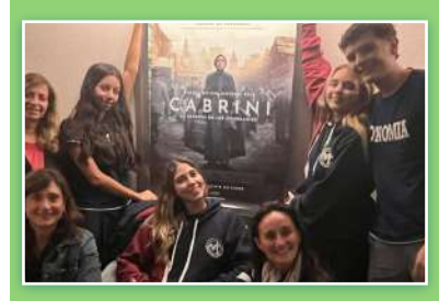
Preview in Argentina.

The third, fourth and fifth graders and their teachers from Mother Cabrini Rosario School were also treated to this wonderful experience on April 17.