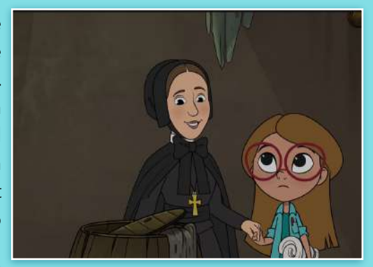
Sequence from the "Cabrini Tuttle twins adventures" cartoon.

From the Denver Shrine, in conjunction with the release of the film 'Cabrini' in 3,000 theaters worldwide, an episode of the Hallow podcast about Mother Cabrini with the voice of Sr. Eileen Currie MSC was released. Mother Cabrini's compassion was the outpouring of her love for Jesus. In the digital document "The Flipbook" from the Mother Cabrini Shrine in New York City, you will find material to help reflect on what compassion is and consider how St. Frances Cabrini can help you increase your own. The shrine is also the focus of an episode of the series "Hidden in Plain Sight." Episode 20 of "Tuttle twins - season 4" also features Mother Cabrini!