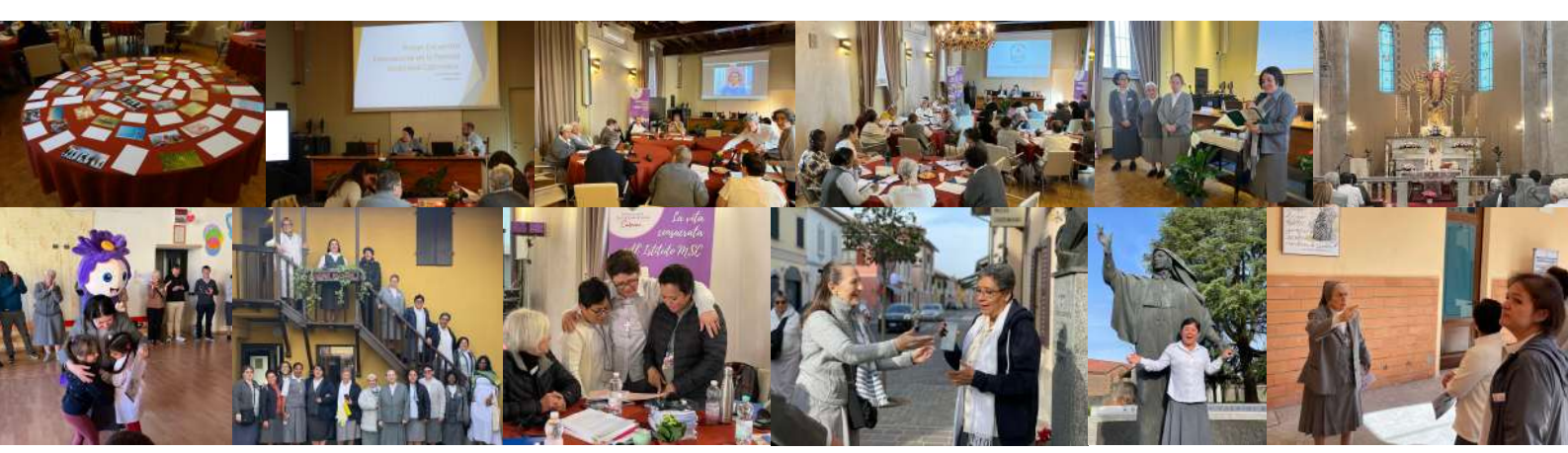
From left: first two photos vocational meeting, IFCT, Extended Council, prayer during Extended Council, Mass at Tabor, Visit to School in Sant'Angelo Lodigiano and group photo at Birthplace, shot from vocational meeting, photo from visit to San'Angelo Lodigiano. Bottom: group photo after Mass at the Basilica in Sant'Angelo Lodigiano.

We thank the Lord for this intense time of communion and sharing!