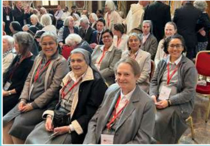
General Audience with Pope Francis after the "Repairing the Irreparable" course.

From May 1 to 5, the General Council and other sisters attended the course "Repairing the Irreparable" organized in Rome by the Shrine of the Sacred Heart in Paray- Le-Monial. This series of meetings, conferences and round tables was organized on the occasions of the Jubilee of the Sacred Heart and the 350th anniversary of the apparitions seen by St. Margaret Mary Alacoque to whom Mother Cabrini was particularly devoted. This experience was all the more precious because on May 4 an audience with the Holy Father took place.