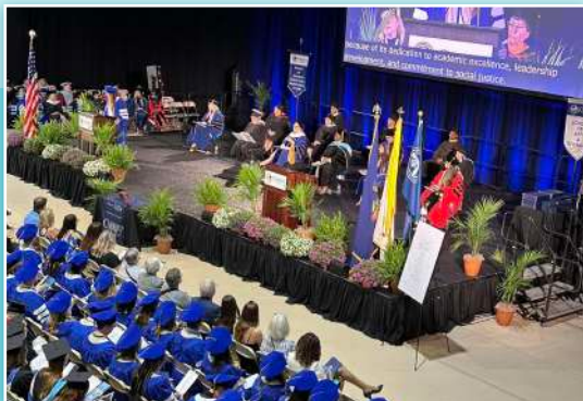
Graduation ceremony at Cabrini University.