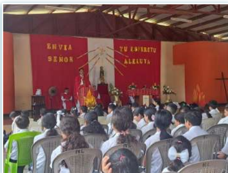
Pentecost celebration in Nicaragua.