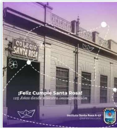
St. Rose Institute anniversary card.