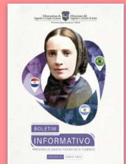
Cover of the first bulletin.

We are very pleased to announce that on the day of the Sacred Heart of Jesus the first issue of the St. Francis Cabrini Province Newsletter came out. The objective of this publication is to publicize the work of the Cabrini Sisters among the co-responsible laity more broadly in Argentina, Brazil and Paraguay and to pass on the legacy of love and missionary zeal of our foundress, Mother Cabrini. The bulletin is in Portuguese and Spanish.