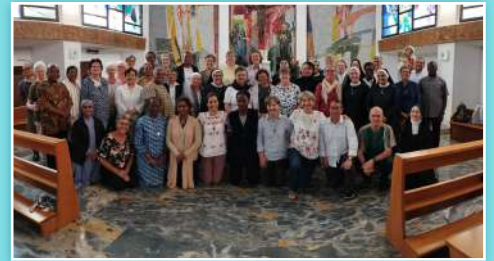
Group photo of the Faith & Praxis course.

From May 31 to June 4 the General Superior and all the Councilors attended a leadership course in Rome planned by the organization, Faith & Praxis for Global Leadership in the ILPD 2024 project.