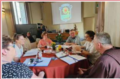
Working group at shrine meetings in Codogno.