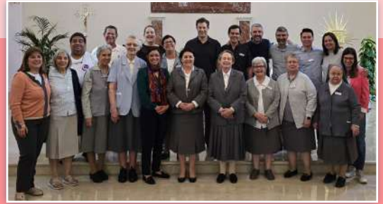
Group photo at the end of the meetings at Via Sicilia.