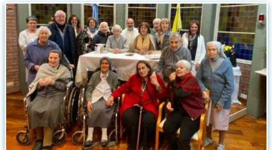
Laity meeting at the Bethany Community.

* On May 19, Pentecost Day, a Pentecost Eucharistic Celebration and the consecration of 30 lectors took place at La Inmaculada College in Nicaragua . The whole community is grateful for the support and advocacy of the families and students who are