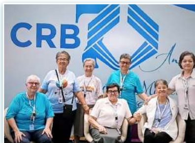
National CRB meeting in Brazil.