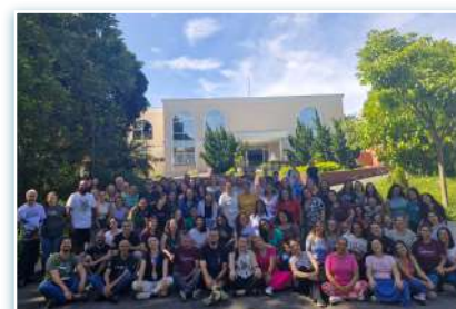
Formation Casa Sagrado Coracao de Jesus.

*On January 20, the educators of the Mother Cabrini School in São Paulo gathered at the Casa Sagrado Coração de Jesus for a formation