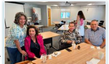
The 'Coffee and Donuts' Initiative.