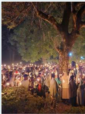
Feast for Our Lady of Lourdes in Dubbo.

Meeting the aspirants of the Addis Ababa community was a moment of spontaneous formation and integration with the entire community.