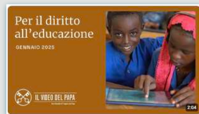
Pope's January video.

Nella In the Nursery School and Primary School in Madrid during the month, families were invited to send a video in which they told how they promote peaceful coexistence through their work. In secondary school students drafted a manifesto for peace, based on the phrase: "To be a light for others." Together with this message they created a candle as a symbol of light. Finally, they concluded the month with a celebration for peace together with the entire educational community. In this event they also welcomed the second year pupils of the first primary school.