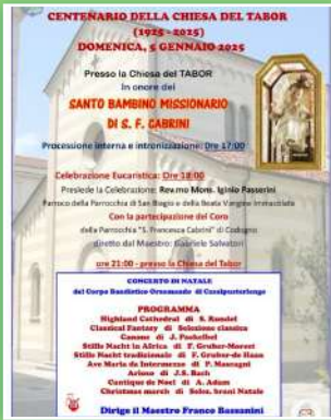
Poster for the January 5 event at Tabor Church.