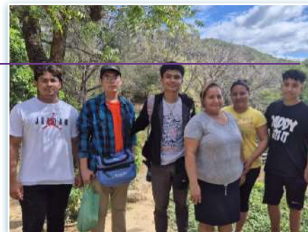
Mission to the countryside in the community of La Danta in Nicaragua.

*At the beginning of each year, in January, the MSCs in Nicaragua perform a special mission of going out and sharing the Gospel in the countryside near their ministry.