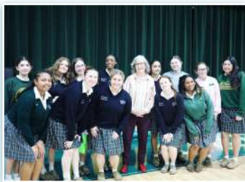
The principal of St. Frances Cabrini Shrine in NYC visiting Cabrini High School New Orleans.