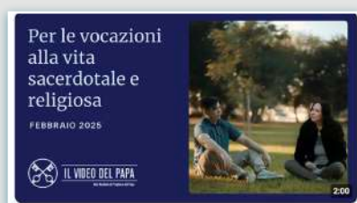
Pope's February video.

A In Madrid they dedicated the month of February to the role of the missionary and how to become missionaries. The motto chosen by the school is the same as the campaign theme: "I share what I have". This campaign of the Pope's seeks to promote mutual aid among the children of the world. They reflected daily on the importance of being grateful, sharing, and helping other children. In the classes, a piggy bank has been distributed so that the children can contribute on a voluntary basis to the different missions that need their help. As every year, they gathered to celebrate the School Day for Peace and Nonviolence together. This year's guiding theme will be "Light a light and make it shine".