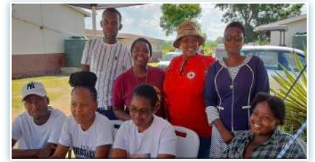
Volunteering at the Malindza refugee camp.