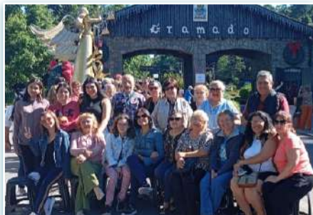
Educational team at the College of San Lorenzo in Paraguay.

* From January 3 to 10, 2025, the MSCs and lay people of Paraguay accompanied the educational team of the Our Lady of Schoenstatt School in San Lorenzo on a cultural trip to Rio Grande do Sul, Canela and Gramado.