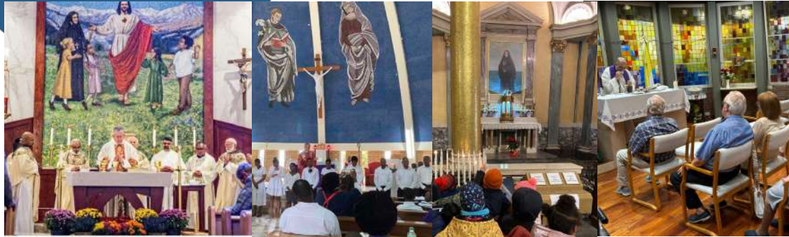
New Year celebrations at Mother Cabrini Shrine in Colorado, Mass Dec. 22 at St. Philips Parish in Ethiopia with confirmation and baptism of several young people, Mass at the school in Sant'Angelo Lodigiano, celebrations with lay missionaries in the Bethany Community in Argentina.

Missionaries of the Sacred Heart of Jesus | January - February 2025 | www.cabriniworld.org